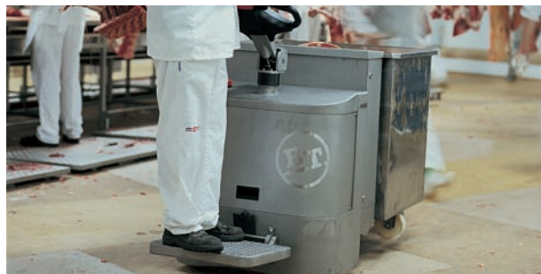
The LPE2001 uses stainless steel for long-lasting performance in corrosive environments