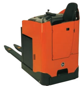
R-series 2000 kg–3000 kg