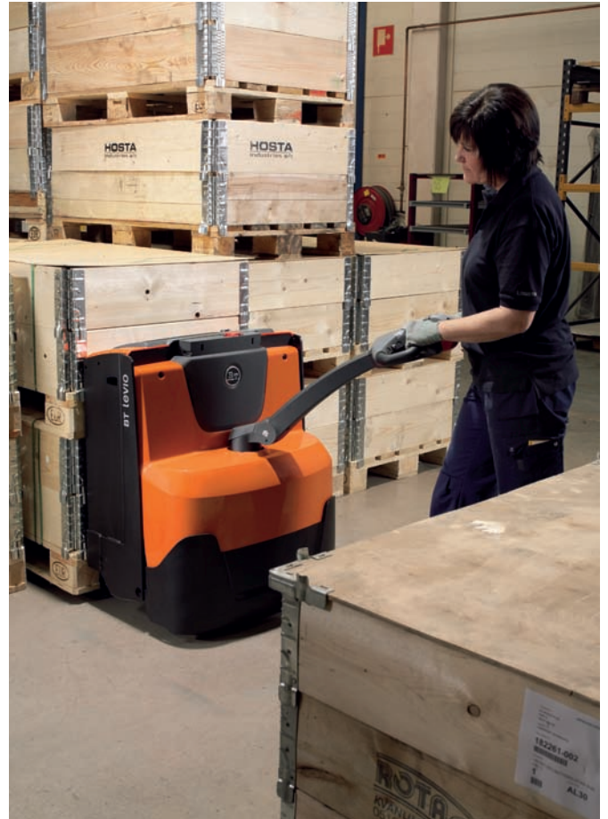
W-series, 1800 kg