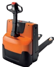
W-series 1400 kg–2500 kg