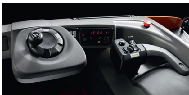
360° steering ensures maximum manoeuvrability and control with minimal effort

Performance parameters can be programmed and easily selected upon start-up. Access is controlled with PIN codes, restricting operation to only authorised drivers. Electronic regenerative braking is programmable to suit the driver – when accelerator is released, and/or when change of travel direction is applied.