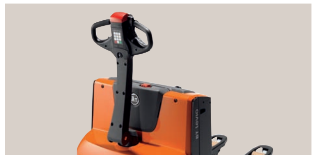
The Click-2-Creep function allows the truck to be manoeuvred with the handle upright