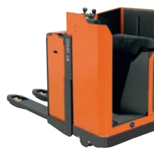
S-series 2000 kg