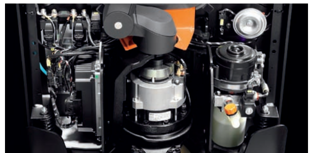
The fixed motor has no moving cables