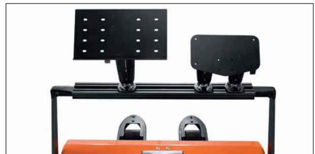
All models are available with the E-bar mounting rail for ancillary equipment such as writing tables and shrinkwrap holders. It can also incorporate a power supply for items such as PCs, radio-data terminals and barcode scanners.