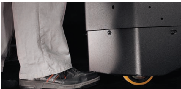
The P-series' low skirt protects the operator's feet without impeding access to ramps and gradients

All BT Levio trucks are built with the highest quality components. For example, all bushings on the LPE240 are constructed from bronze, with lubrication points, for a long and reliable life.