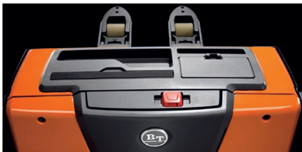
Fork tips are clearly visible from the operating position for added safety and ease of use

The 2000 kg model (LWE200) can be specified with flip-down operator platform for applications demanding longer travel distances.