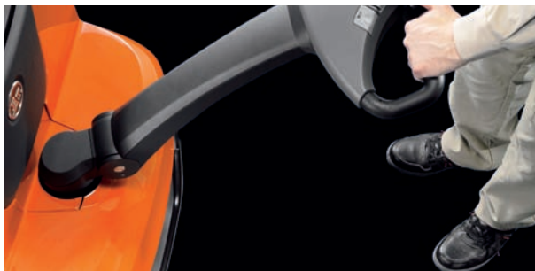
BT Levio W-series' rounded profile helps it get round the tightest corners