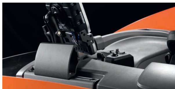
The E-bar universal mount for warehouse management devices such as PCs, terminals, bar code readers