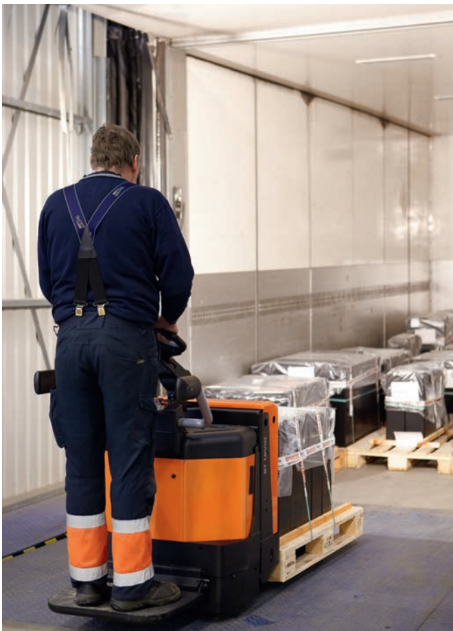
P-series, 2000 kg