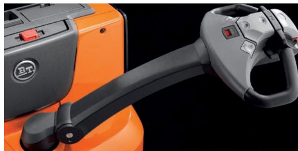
The control arm incorporates BT Powerdrive technology and offers easy, intuitive operation