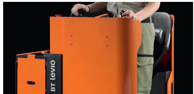
All S-series models offer excellent protection for the operator