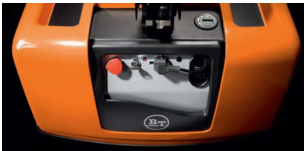
The emergency stop button and the lead for the built-in charger are easily accessible to the operator

The LWE130 features the unique BT Castorlink system for optimum stability. The castor wheels rotate within the truck's body profile, providing added safety for the driver and load.