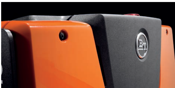
The hood is secured by two bolts for fast access

In line with this philosophy, the W-series' AC drive motors have fewer wearing parts than DC equivalents and many of the truck's bushings are made of a Teflon-coated composite material that improves their working life and eliminates the need for greasing. Sealed connectors, non-contact switches, leak-free hydraulic connectors and CAN-Bus wiring all add up to maximum reliability. BT Levio W-series is designed to be serviced only once a year in typical single-shift operations.