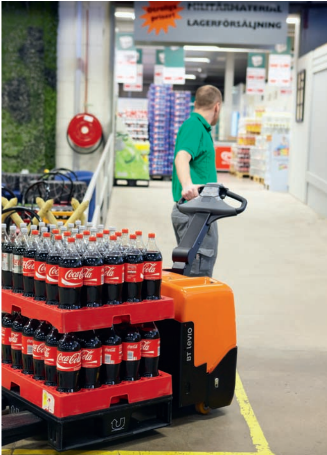
W-series, 1300 kg