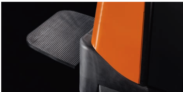
BT Levio P-series models' flip-down platforms aid productivity in long distance applications without compromising manoeuvrability

Another concept invented by BT – the P-series' Powertrak chassis – automatically adjusts the drive wheel pressure to suit the load, thereby increasing traction and virtually eliminating wheelspin.