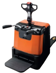
P-series 2000 kg–2400 kg