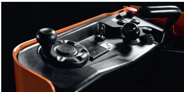
The LSE200's 180° steering makes it easy to drive

The forks on the LSE200 have bogie wheels and can be elevated to 235 mm. This makes it ideal for handling roll cages and work on gradients and uneven surfaces.