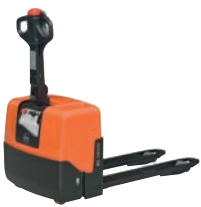
W-series 1300 kg